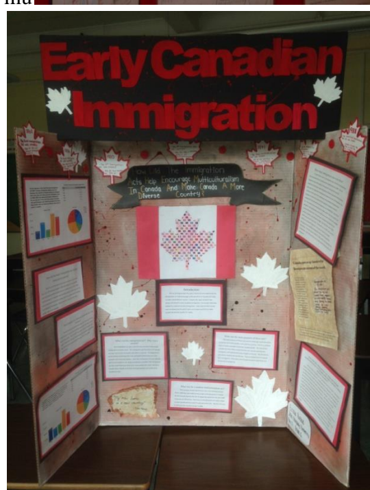
June 27 Canadian Multiculturalism Day - This event was also participated by unions, communities and municipality of Whitehorse. I reached out to Yukon Federation of Labour and PSAC North Representative for Racially Visible Members to organise an event to celebrate this day. There was enthusiasm and great interest in partnering up to organise an educational and